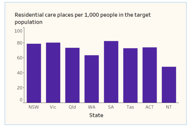
Figure 1: Places in mainstream residential care per 1,000 people in the target population, by state, 30 June 2017

However, the Northern Territory also has a large number of flexible care places relative to the target population. The National Aboriginal and Torres Strait Islander Flexible Aged Care Program provides 33 places per 1,000 people in the target population in the Northern Territory.