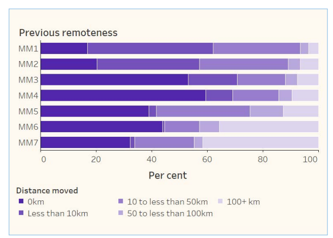
Figure 2: Distance people moved for first admission into permanent residential aged care, by remoteness, 2013–14

More than half (56%) of people living in regional areas near towns of 5,000–50,000 people did not move for permanent residential care, while under half (40%) of people living in remote/very remote areas had to move more than 100 kilometres.