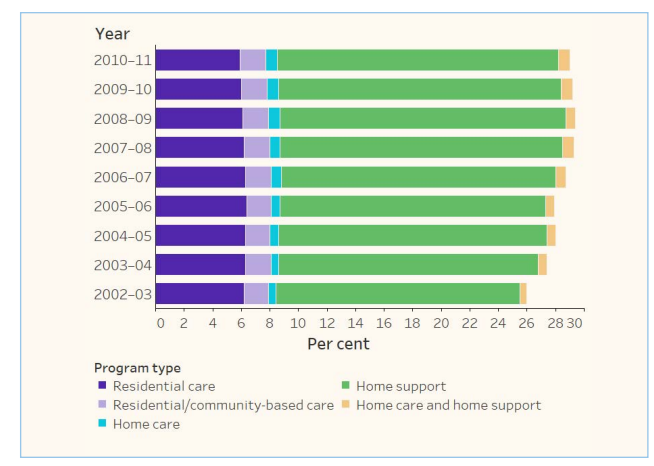
Figure 3: Proportion of the older population (aged 65 and over) using aged care, by year and program type, 2002–03 to 2010–11

Between 2002–03 and 2010–11, the proportion of older people using residential aged care has decreased, and the number of older people using community based care has increased (figure 3)