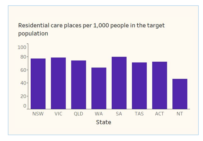
Figure 1: Places in mainstream residential care per 1,000 people in the target population, by state, 30 June 2019

The Northern Territory had the lowest ratio for residential aged care places (46 places per 1,000 people in the target population) (Figure 1). However, the Northern Territory also had a large number of flexible care places relative to the target population. The National Aboriginal and Torres Strait Islander Flexible Aged Care Program provides 38 places per 1,000 people in the target population in the Northern Territory.