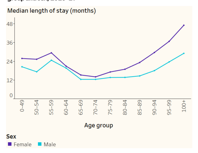
Figure 3: Length of stay in permanent residential care, by age group and sex, 2020–21

Although the majority of people using aged care services are people aged 65 and over, younger people also access and exit these services. For exits that took place in 2020–21, the median length of stay in permanent residential care and home care was longer for women than men. For both men and women, the median length of stay in permanent residential care generally increased with age from age 70 onwards, with the longest length of stay for people aged 100 and over (just over 3 and a half years) (Figure 3).