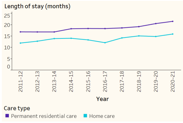
Figure 2: Length of stay by care type, 2011-12 to 2020-21

Between 2011–12 to 2020–21 the number of exits increased for most care types. The largest increase in exits was for home care (62% increase–from 23,400 to 37,900), followed by respite residential care (30% increase–from 62,600 to 81,100). This may be explained, in part, by increasing numbers of people using these services over time.