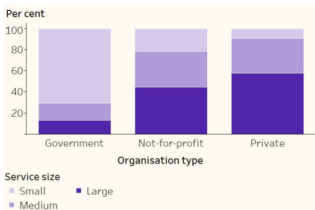
Figure 2: Places in residential aged care by organisation type and service size, 30 June 2021.

Notes: Small = 60 or fewer operational places, Medium = 61–100 operational places and Large = 101 or more operational places. Counts as at 30 June.